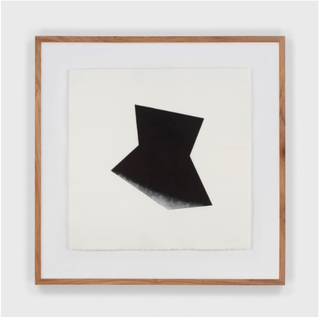
Grace Mokalapa Abyss Monolith I, 2020 Monoprint of Fabriano paper 60 x 60cm Framed size: 82 x 82cm