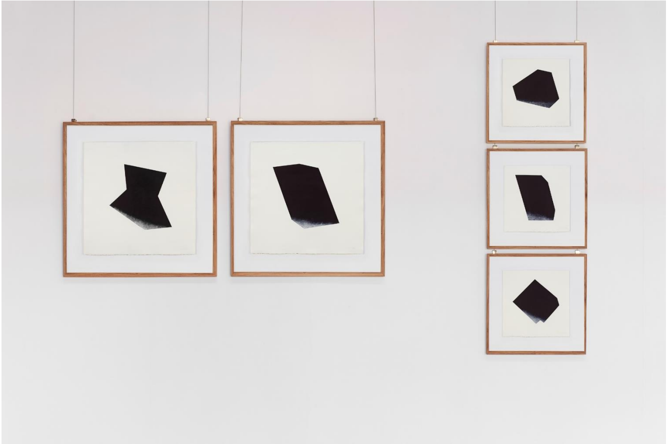
INSTALLATION PHOTOGRAPH | GRACE MOKALAPA