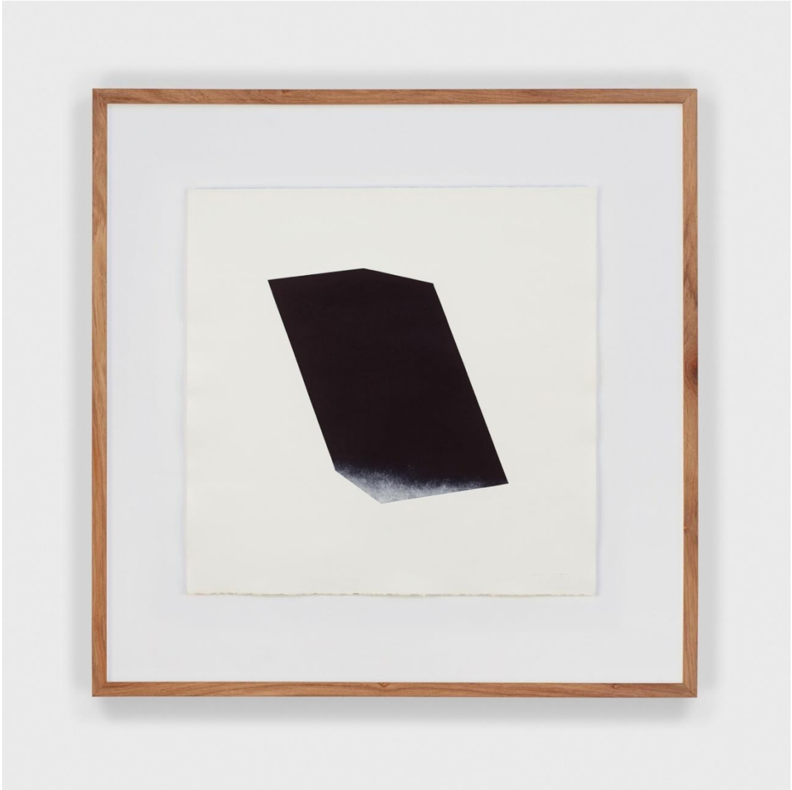
Grace Mokalapa Abyss Monolith 2, 2020 Monoprint of Fabriano paper 60 x 60cm Framed Size 82 x 82cm