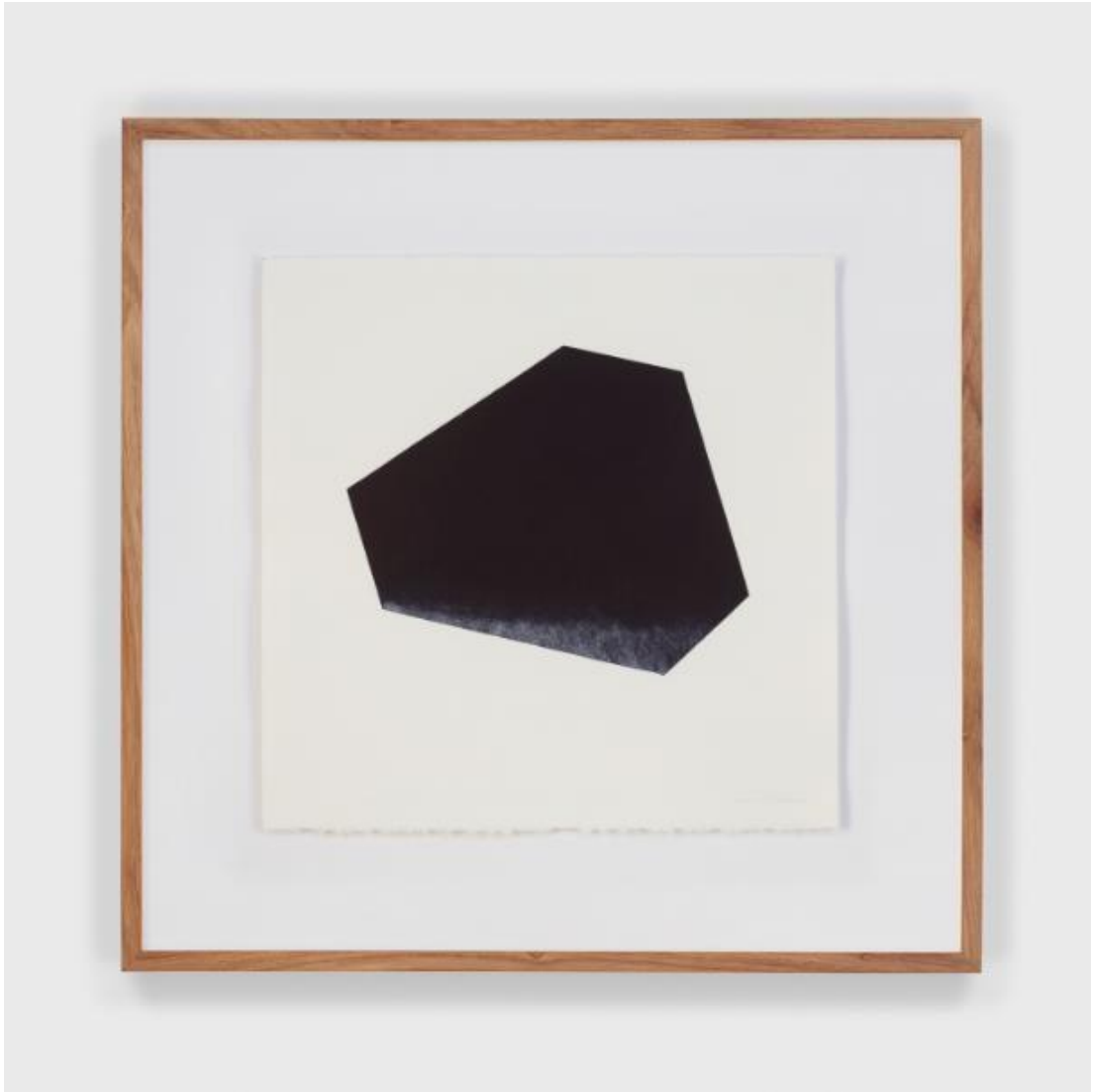
Grace Mokalapa Uncanny Void Terrain 2, 2020 Monoprint of Fabriano paper 35 x 35cm Framed size: 53 x 53cm