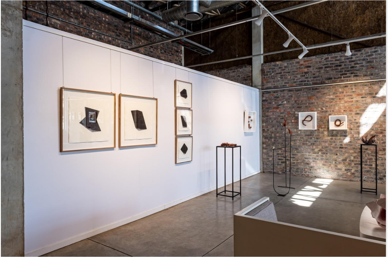
INSTALLATION PHOTOGRAPH | GRACE MOKALAPA