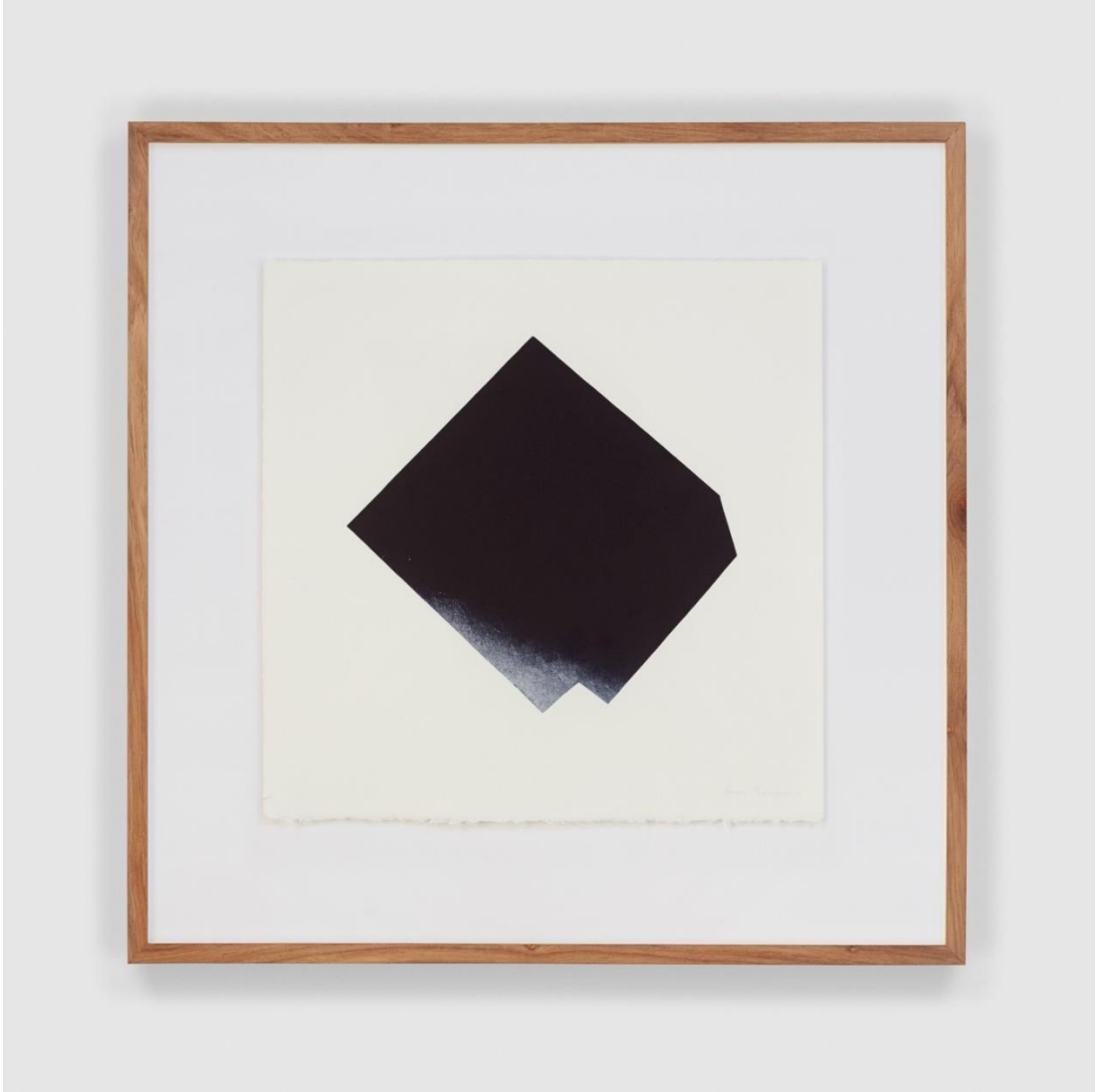
Grace Mokalapa Uncanny Void Terrain 3, 2020 Monoprint of Fabriano paper 35 x 35cm Framed Size 53 x 53cm