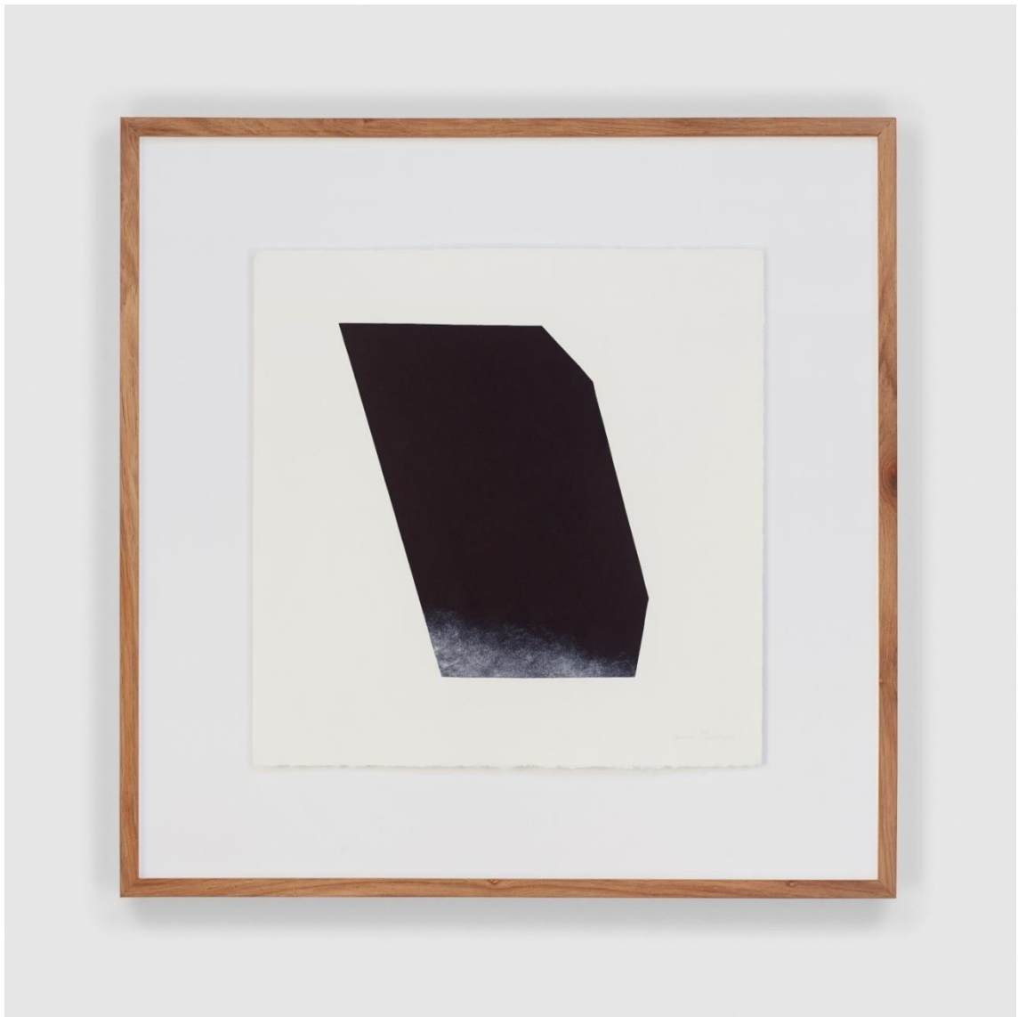
Grace Mokalapa Uncanny Void Terrain I, 2020 Monoprint of Fabriano paper 35 x 35cm Framed Size 53 x 53cm